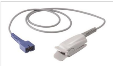
Monitor Spo2 Sensor