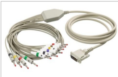
ECG Machine Cable