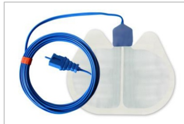
Disposable Patient Plate