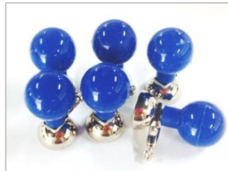
ECG Silicon Bulb