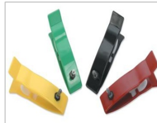
ECG Clamp Electrode