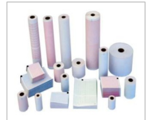
ECG Thermal Paper