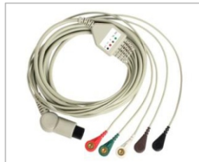
Monitor ECG Cable